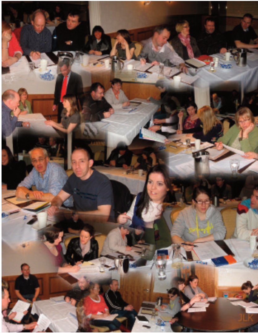
DONEGAL BRANCH REPRESENTATIVES' TRAINING, 28/1/10