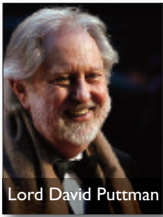
Lord David Puttnam

“A world-class education system will, over time, deliver a world-class health service – the reverse can never be possible.”