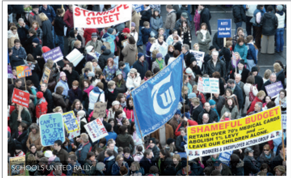
SCHOOLS UNITED RALLY

In my address to the Schools United Rally in Dublin last December I stated that we would “let all political parties know that when they come before the electorate that there would be a heavy political price to be paid for sacrificing our children’s future”.