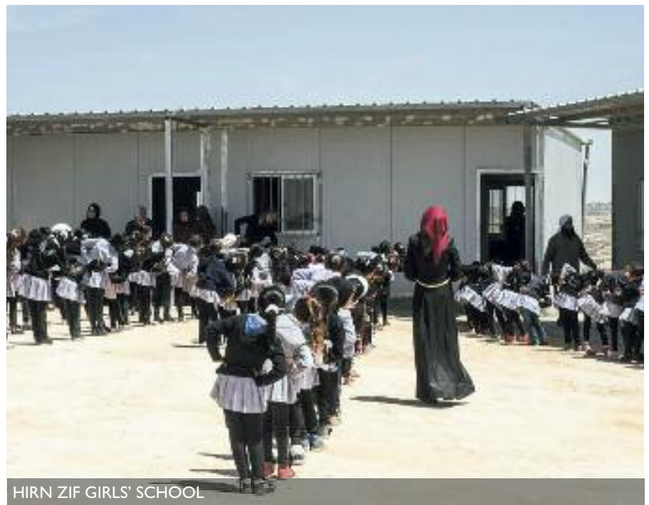
HIRN ZIF GIRLS' SCHOOL

If anyone has an idea for the TUI Third World Fund, and if it's achievable and feasible within a specific timeframe then you should apply. The creation of this girls' school all happened within a six-month period. They had everything ready to go, builders and materials. They just needed the extra push on funding and it all happened. You should definitely look for projects that are sustainable and that have support on the ground. The development model of 'we know best what you need' doesn't always work, so it's great to engage with organisations on the ground. The idea of education as a human right comes alive in Palestine in ways you might not find in other places, especially for the girls for whom early school leaving has been the trend. So, look out for ways to link education with development. When you ask the girls what they want to be when they grow up they say 'doctors, teachers, nurses' – they have the same dreams and aspirations as girls here. The more support and solidarity between teachers around the world the better and the TUI Third World Fund is a great way to express this.