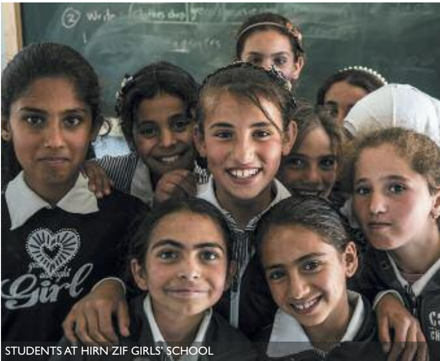
STUDENTS AT HIRN ZIF GIRLS' SCHOOL