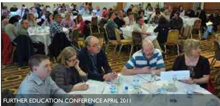
FURTHER EDUCATION CONFERENCE APRIL 2011

A full summary of the main ideas generated will be placed on the TUI website and extranet shortly.