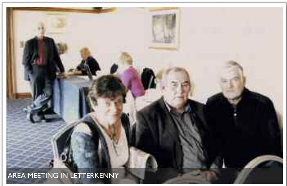
AREA MEETING IN LETTERKENNY

As already mentioned I attended the recent AGM of the Retired Secondary Teachers Association. We have a very good relationship with them and they invite us all to join them on their outings and events. The trouble is we don't always know when they are on. However, they have given me details of their next trip to Spain. Spanish Adventure for RSTA members and friends, Hotel Las Palmeras*** Fuengirola, Spain October 4th - 14th 2011 for more details contact me and I will send on the information. I have also been requested to inform you of an upcoming pilgrimage to Padua, Assisi, San Giovanni and Pietrelcina including