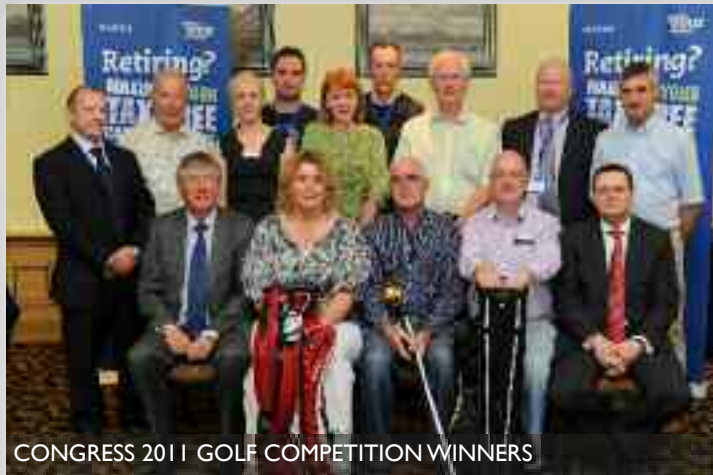
CONGRESS 2011 GOLF COMPETITION WINNERS