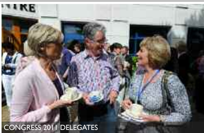
CONGRESS 2011 DELEGATES

Many CID claims have been ruled upon in different forums and the outcomes are often contradictory thus confusing Branch Officers who attempt to advise members on this important contractual matter.