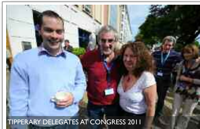
TIPPERARY DELEGATES AT CONGRESS 2011

Congress instructs the Executive to do all in its power to secure an indefinite extension to the alleviation of the moratorium on the filling of the post of Director of Adult and Community Education in place since 27th March 2010, in which the link between the post of Deputy Principal and that of Director of Adult Education and Community Education is further strengthened.