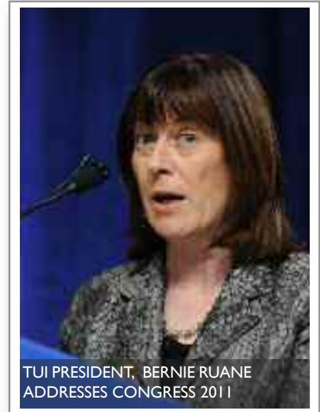
TUI PRESIDENT, BERNIE RUANE ADDRESSES CONGRESS 2011

I have seen parents in local supermarkets collecting tokens to buy computers for public schools while at the same time we are funding privileged schools who can afford to build swimming pools and golf