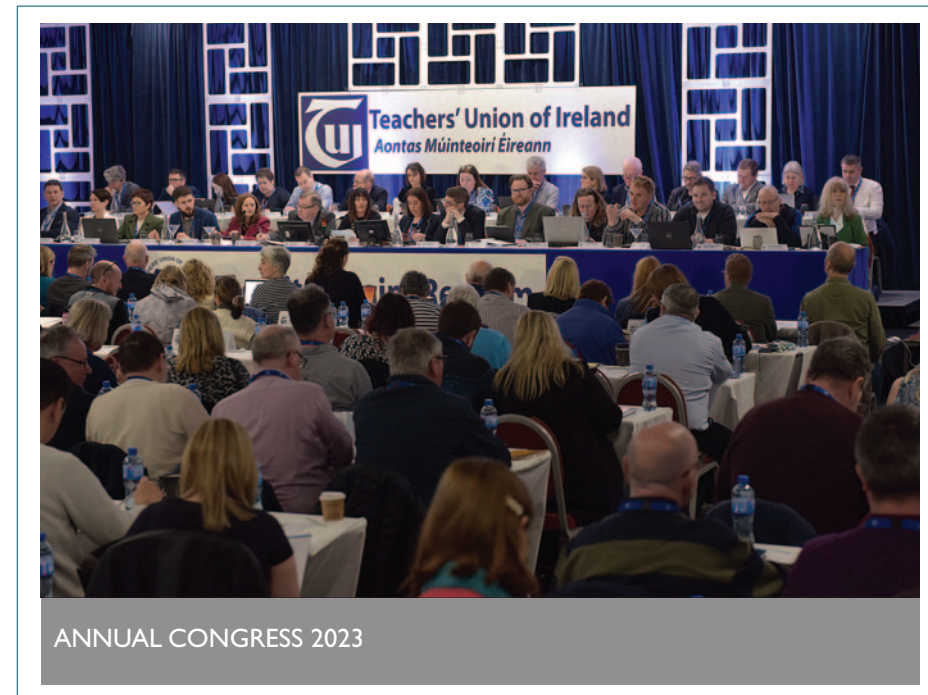
ANNUAL CONGRESS 2023

Congress notes the circulation by Academic Administration of materials that are inappropriately politicised and explicitly endorse contestable