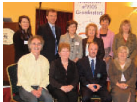
Delegates from VTOS conference pictured with Minister Sean Haughey

As this conference on VTOS 20 concluded, one was reminded that it was the voters of Limerick East some 40 years earlier, who elected a Minister for Education who declared that Secondary Education would be free to all. A vision and a plan in difficult