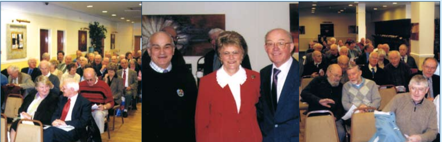
DELEGATES AT THE RMA'S SPECIAL CONFERENCE, MARCH 7TH 2007