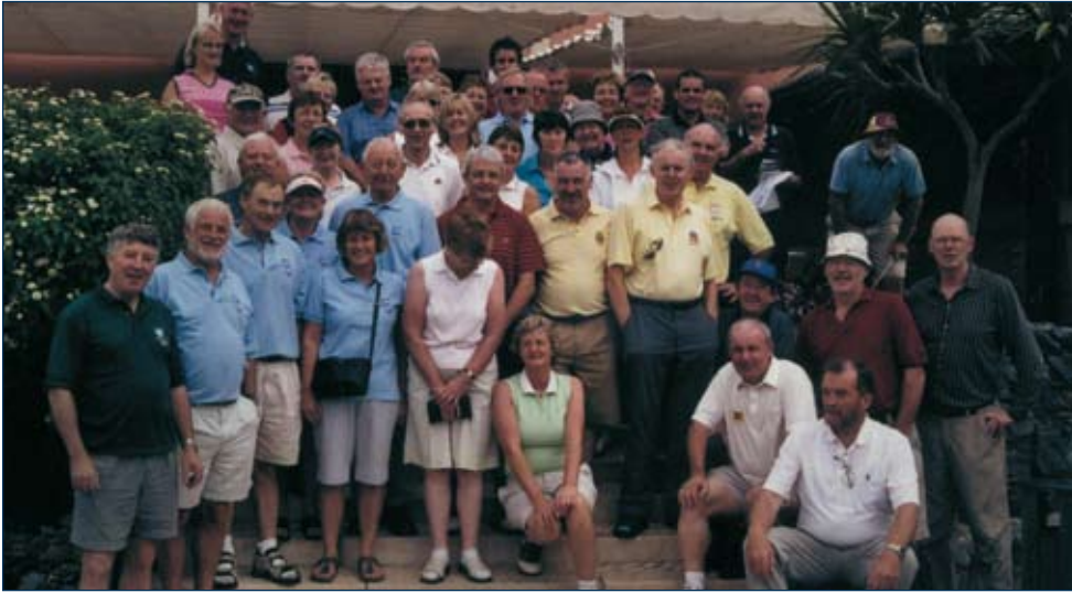
TUI GROUP PRIOR TO PLAY AT PENHA LONGA