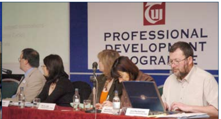
TOP TABLE AT TUI CURRICULUM AND ASSESSMENT SEMINAR, TULLARMORE, FEBRUARY 2007