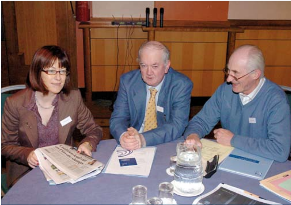
DELEGATES AT TUI CURRICULUM AND ASSESSMENT SEMINAR, TULLARMORE, FEBRUARY 2007