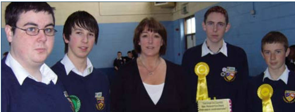
BALBRIGGAN YOUNG SCIENTISTS

Balbriggan Community College had four projects accepted for the finals of the BT Young Scientist exhibition 2007, which was held in the RDS from 9th – 13th January.