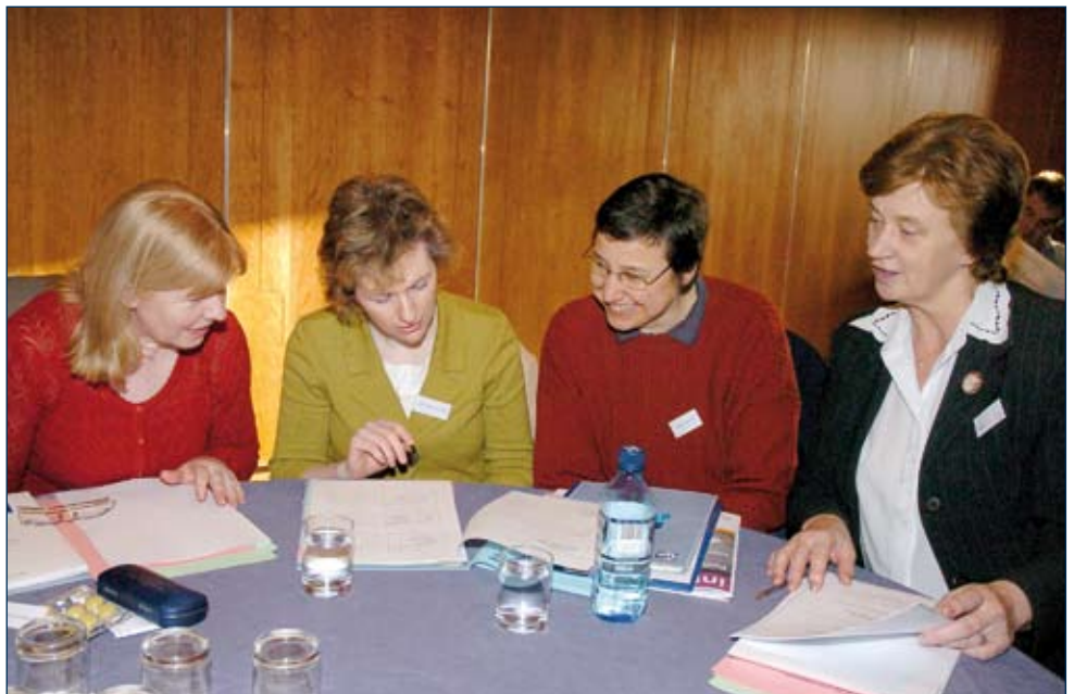
DELEGATES AT TUI CURRICULUM AND ASSESSMENT SEMINAR, TULLAMORE COURT HOTEL, FEBRUARY 2ND 2007