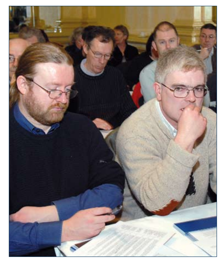
SPECIAL CONSULTATIVE CONFERENCE, ROYAL DUBLIN HOTEL, 7TH FEBRUARY 2007.