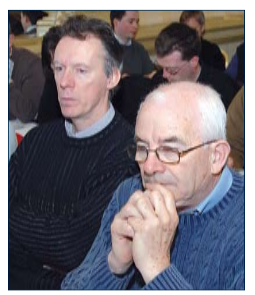
SPECIAL CONSULTATIVE CONFERENCE, ROYAL DUBLIN HOTEL, 7TH FEBRUARY 2007.